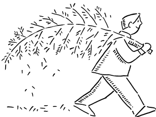
Removing of the Greens

Boxed Offering Envelope Sets - Boxed offering envelope sets will be made available upon request. Envelopes are NOT required or needed. Only request a set if they assist you in keeping up with your tithe and contributions. Contact Jackie if you would like a set: jtoenes@seminolepca.org or leave a message at (813-220-4095).